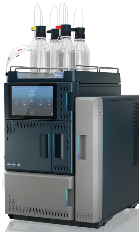
The Alliance iS HPLC System

To meet global compliance needs, the Alliance iS HPLC System features enhanced temperature control in the sample manager, column manager and detector. Additionally, when coupled with Empower