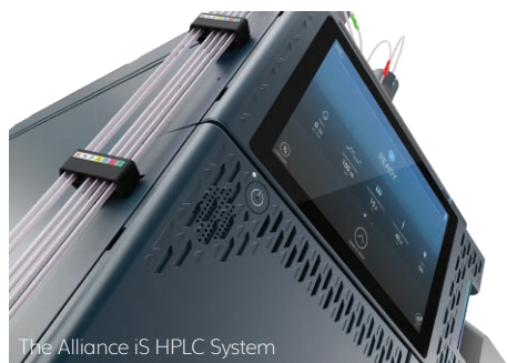
The Alliance iS HPLC System

Specifically designed to be intuitively simple, the Alliance iS HPLC System reduces the burden of training your staff. An intuitive